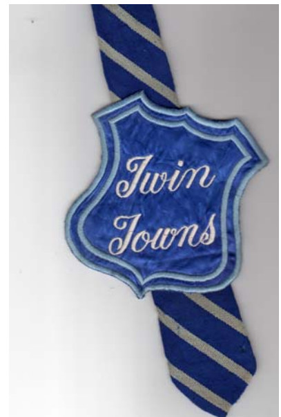
Original tie and badge